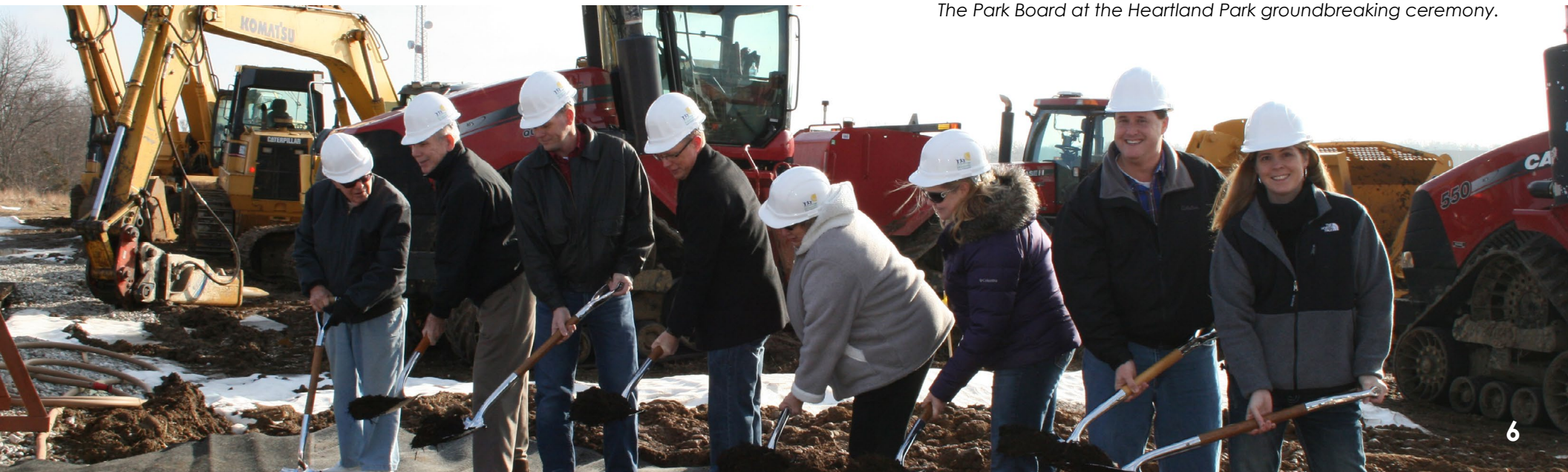
The Park Board at the Heartland Park groundbreaking ceremony.